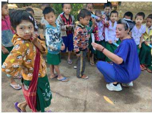
The team helping and Oral Health educating the children at the monastery

After over 15 trips and as many years as dental volunteers across Africa and Nepal, we would like to share our last experience providing urgent dental care to 1,200 orphans at the Phaya Tuang Monastery, in Myanmar.